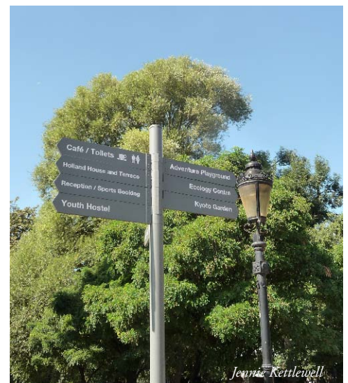
New signpost in the park

At last the new signage is being installed in the park. After much debate, your trustees are pleased that the choice was elegant, grey finger posts, as you see in the photo. If you already know your way about the park, you hardly notice them. If you are looking for direction, they are easy to find and follow – as already observed in the park. The information boards will be installed shortly, near to entrances, in equally elegant style.