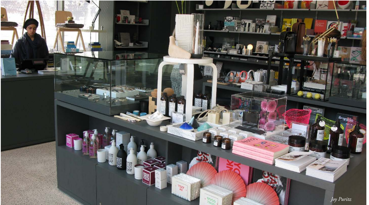
Design Museum shop