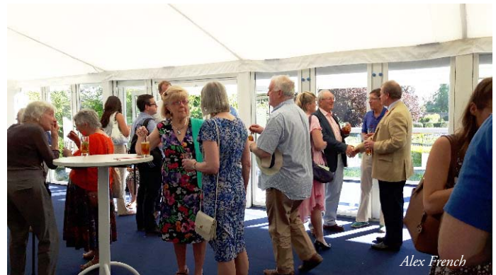
Pimm's in the marquee