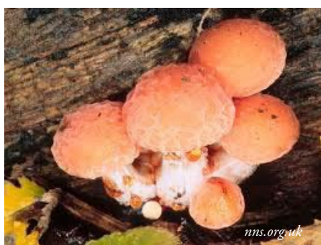
Rhodotus palmatus (Wrinkled peach)

Why are fungi important to wildlife? Their fruiting bodies, the bits we see, provide food for beetles and insects that in turn support mammals and birds and so support biodiversity. More widely recognised is their ability to break down dead substances and thus recycle nutrients. Did you realise there are about 3,000 larger species in the UK, and some of them are very specialised? There is one group that break down the lignum in wood, leaving the cellulose as a stringy substance, and another group that break down the cellulose leaving the lignum in squarish blocks. Most fungi live off dead material but even those that attack living organisms have their virtues: the dreaded honey fungus attacks mostly stressed trees, and in a forest leads to clearings that allow for natural regeneration. Fungi hold territory like many animals and will initiate chemical warfare if they come up against a rival.