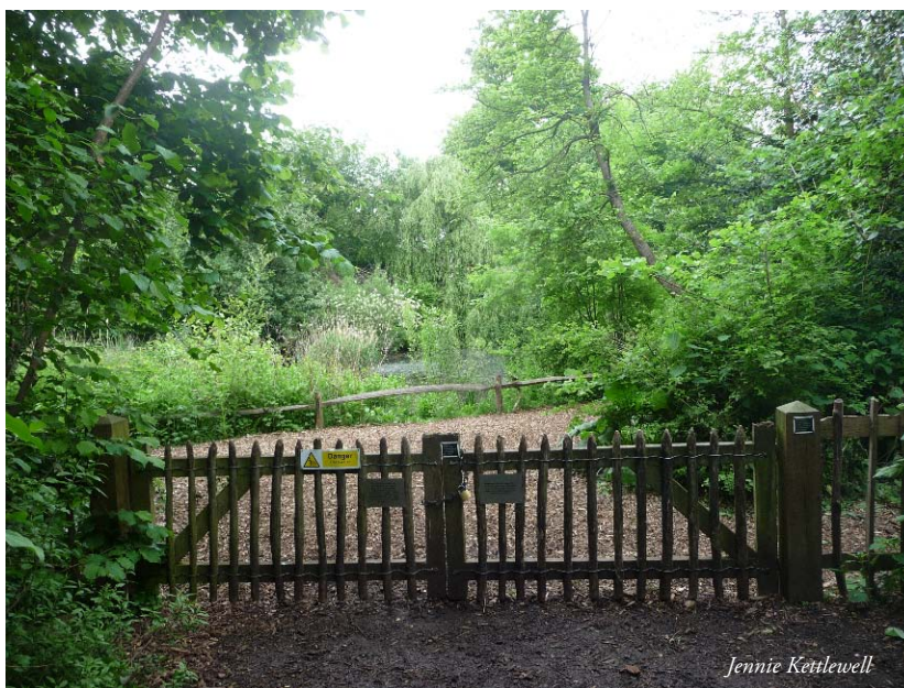
Wildlife Area gates with pond behind

We often get questions about the pigs and cows that arrive in the Arboretum and Oak Enclosure meadows some years. This year there will be no grazing animals. This is because there is little grass but a great many nettles. Nettles are great for pollinators, but animals do not much appreciate them as food. Predominance of nettles occurs when soil nutrient levels are high (all those cow pats!) and the solution is that the growth will be manually cut and removed rather than grazed. Next year the situation will be re-assessed and, who knows, we might have pigs, cows or sheep.