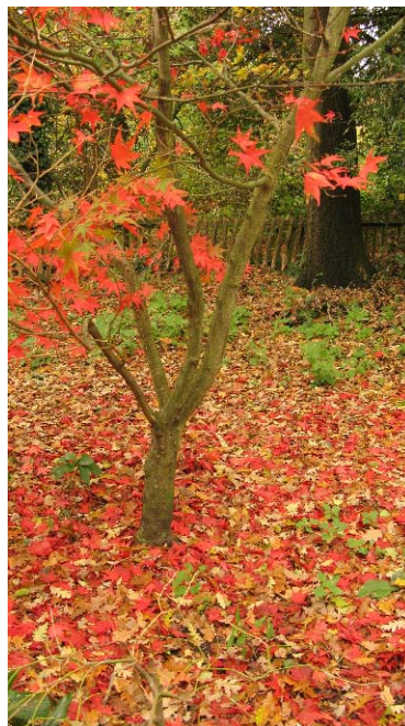
The cover photo was taken by your editor on Acer Walk last November