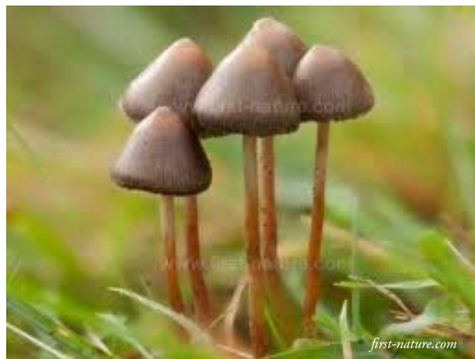
Psilocybe semilanceata (Magic mushroom)

The next Fungi Foray: 5 November (see Dates for your Diary).