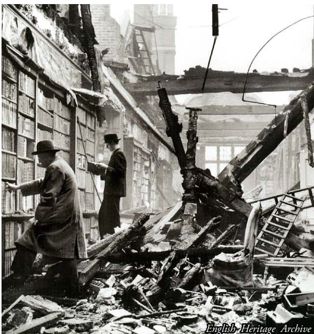
The bombed library