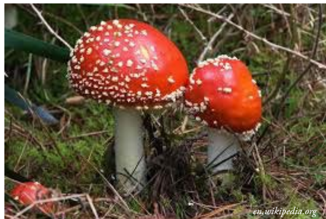
Amanita muscaria (Magic mushroom or Fly agaric)

Groups of fruiting bodies usually belong to one organism. If they are in a straight line it is called trooping and might well be following a tree root. A fairy ring occurs when one spore lands