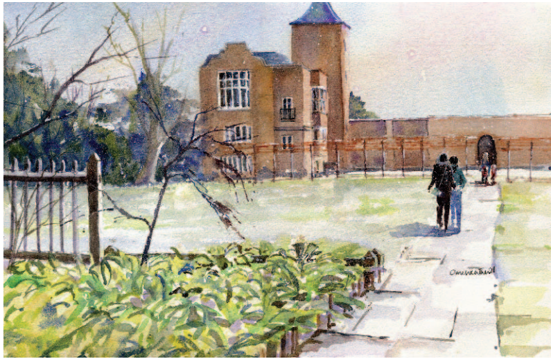
Holland House from Acer Walk, by Clare Weatherill

This year Clare Weatherill has produced another of her popular designs now showing Holland House from the beginning of the Acer Walk with the hellebores seasonally in leaf. It is winter, so the house is not obscured by the opera tents. We will hold a ready supply of these in both the standard 152mm x 197mm format at £9.50 the pack of ten, and the small 118mm x 168mm at £7.50. We will also make up mixed packs of old designs of Holland Park at £6.50, which will include eight big and two small in at least five different designs, and no more than two of each design. These can all be very quickly delivered: the mixed packs from the date of you reading this and the new ones from early November. If your newsletter