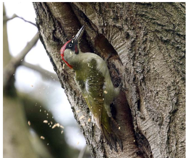
Green woodpecker carving a new hole

During the monthly Nature Walks, which include visits to the enclosed wildlife area, there are chances of seeing some of the