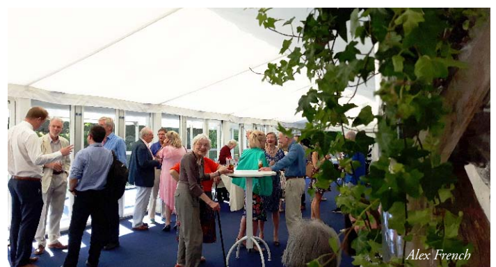
Pimm's in the marquee