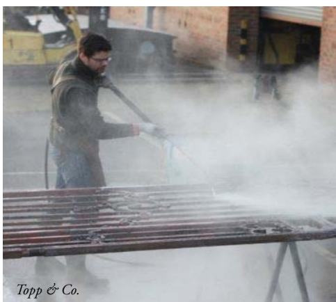
Topp & Co.

the gates, but the high cost delayed action – until this year. Funding was eventually made available through the 106 Agreement with the Commonwealth Institute developers.