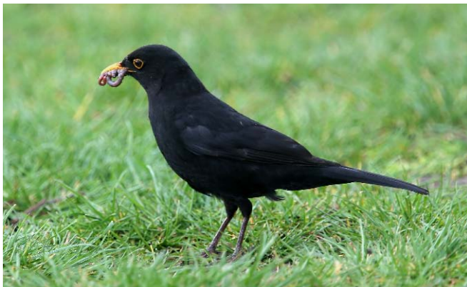
Blackbird with a worm

Its founders and subsequent managers have enriched it with trees and shrubs from around the world, but its woodland and wooded meadows retain the essence of the English countryside.